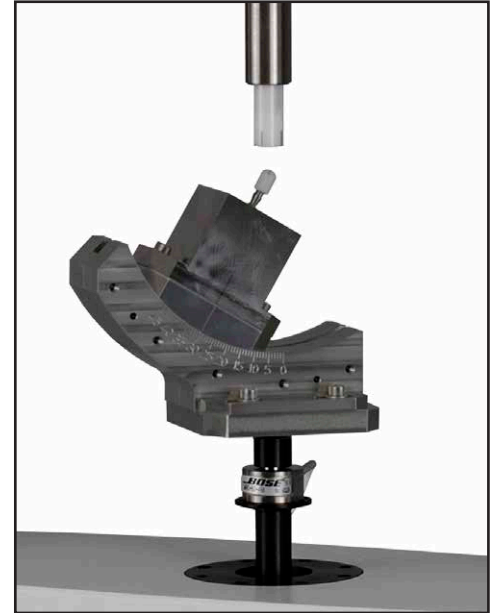
Bose® ISO 14801 Implant Fatigue Fixture