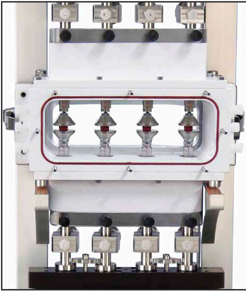
Sealed Chamber to Allow Anaerobic Conditions During Mechanical Loading of Dental Tissues

Dental tissue engineering research aims to identify alternative therapies to treat dental tissue diseases or traumas which include caries, fractures, and periodontal disease. Stem cells for dental tissue engineering can be harvested from a number of sources including human exfoliated deciduous teeth, adult pulp, and the periodontal ligament. These stem cells have the potential to differentiate into dental tissue specific cells, such as odontoblasts, and ameloblasts which are instrumental in the formation of dentin and enamel, respectively.