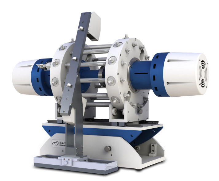
12 Tube DuraPulse SGT with Optical Micrometer Accessory

Proprietary electromagnetic ElectroForce linear motors offer the most dynamic performance in the industry, achieving higher test frequencies than competitive systems. This friction-free technology provides unmatched responsiveness, enabling consistent and precise control of volumetric displacements and pressures. ElectroForce motors utilize a flexural suspension, eliminating the need for bearings that wear out over time. DuraPulse SGTs deliver the reliability required for long-term testing and the motors are backed by an industry-leading 10 year warranty.