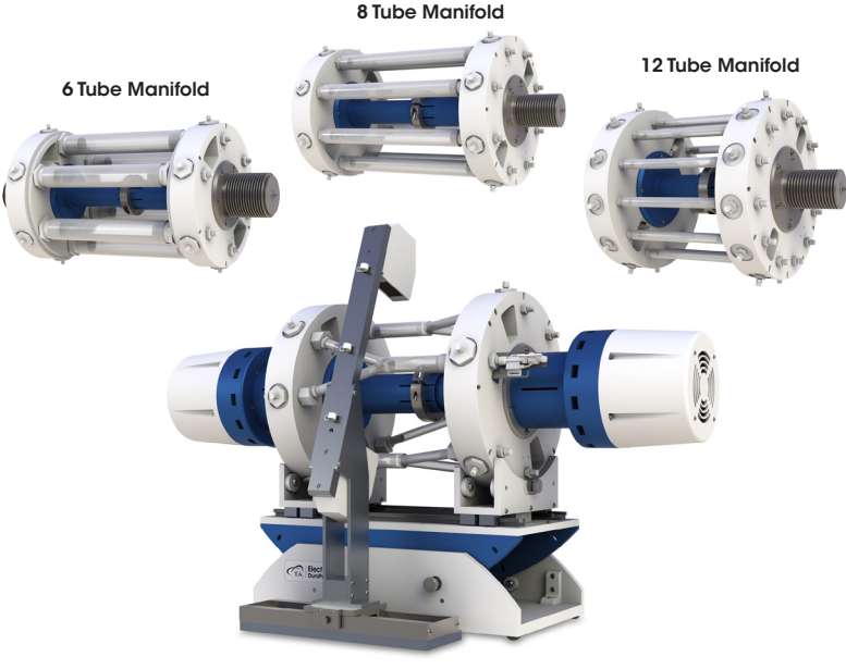
4 Bifurcated Tube DuraPulse SGT with Optical Micrometer Accessory and Optional Manifold Kits