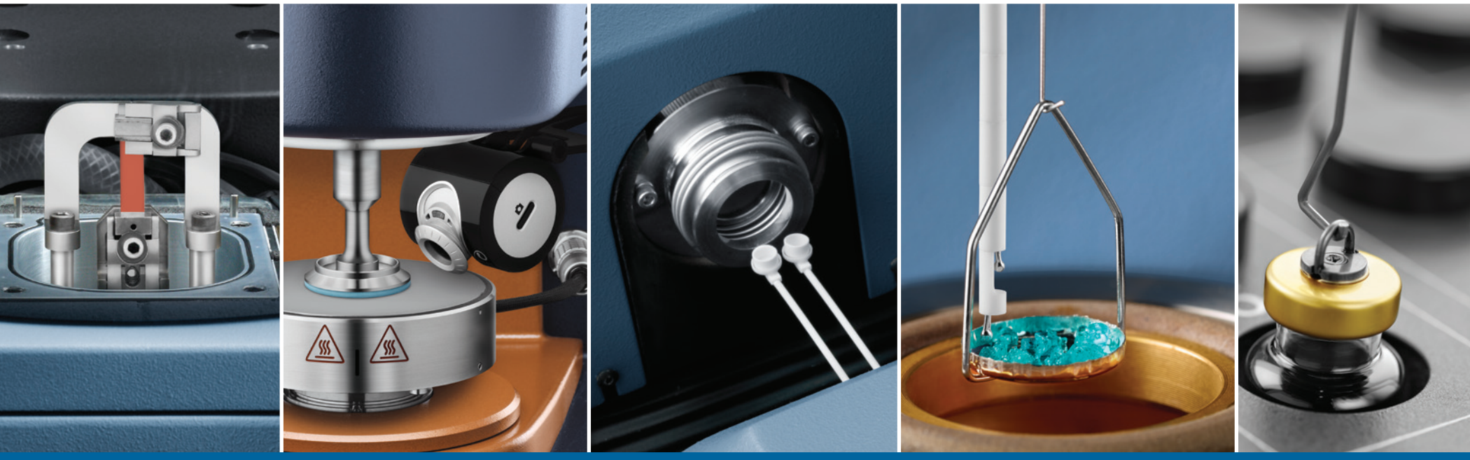
Note: Prices and descriptions are subject to change without notice.