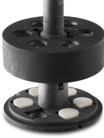
EM-2800 Graphite Sample Carouse