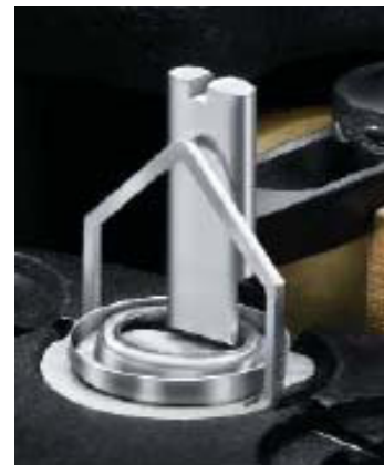
Figure 2. Q5000 SA sealed pan

In this study, a common household latex paint was analyzed using the Q5000 SA moisture sorption analyzer. The paint was initially stirred per the manufacturer’s instructions. Samples were then drawn, placed into special sealed aluminum crucibles and were then loaded onto the robotic autosampler of the Q5000 SA to await analysis. Just prior to insertion into the humidity chamber, the Q5000 SA can automatically punch open the sealed pan (as shown in Figure 2). This ensures the sample does not “pre-dry” before gravimetric analysis is performed.