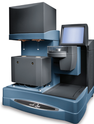
Figure 1. The Q5000 SA Moisture Sorption Analyzer

The Q5000 SA represents the state-of-the-art in moisture sorption analyzers. Its design integrates the latest high sensitivity, temperature controlled thermobalance with an innovative humidity generation system, advanced autosampler with sealed-pan punching, and excellent software. This creative and flexible design makes the Q5000 SA ideal for non-traditional moisture sorption experiments, and extends the application of this field to a wide range of samples.