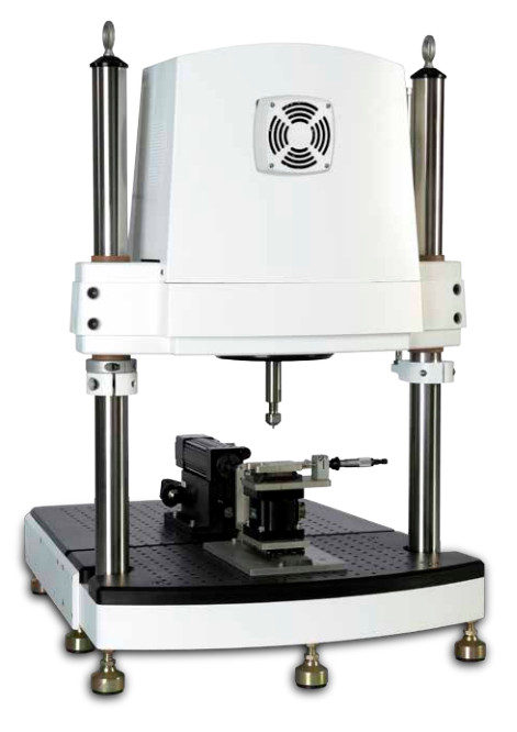
ElectroForce® 3330 Dental Wear Simulator

ElectroForce has developed application software to set up and accurately simulate complicated wear profiles and test conditions. The software can be used to simulate tooth wear over a variety of test situations. The wear simulation software allows the user to easily define test conditions and automatically adjust the system variables to maintain these test settings. The Designer Test Language, a proprietary ElectroForce application tool, was used to create a user interface specifically for the wear application. It allows easy definition of the complex parameters of the test, display of the test status, and the ability to pause the test during the test execution. In addition, through the use of this software, the researcher can create wear profile templates, which can be archived and retrieved later for different test programs. This application is an excellent example of how the advanced features the WinTest<sup>®</sup> Controller can be used to accurately simulate complicated test conditions.