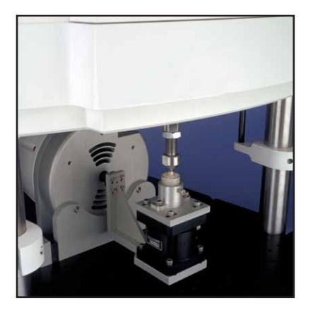
Tooth Sample being Tested

The three-dimensional masticatory motion can be simplified into two-dimensional motion by aligning the two linear motors to the desired planes of motion. One linear motor is positioned vertically to provide frontal plane motion that is defined by the occlusal anatomy, while the second linear motor provides a straight-line approximation of horizontal motion.