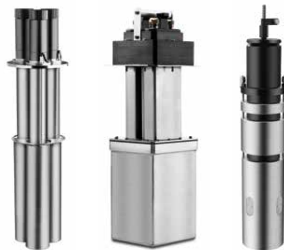
20 mL Multicalorimeter