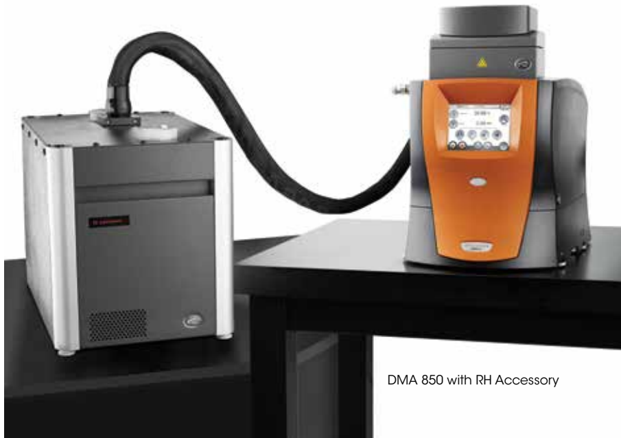
DMA 850 with RH Accessory