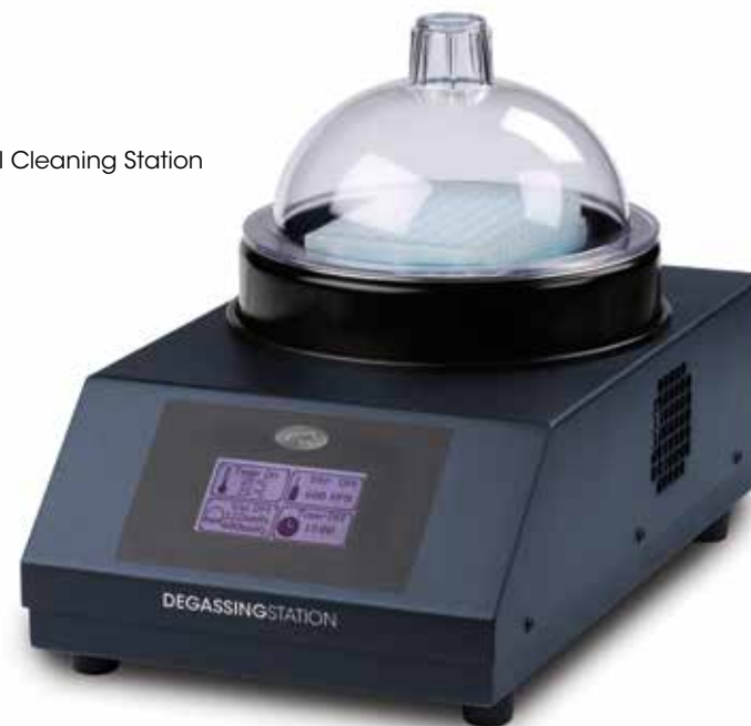
Cell Cleaning Station